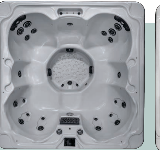
REGAL ETS 31 Jets | 2 Jet Pumps Shown in Silver Satin Shell

The collection of Regal models within the Viking series offers barrier-free seating at it's best. Featuring two of the unique three direction corner seats, get the ultimate hydromassage you're looking for. With LED lighting and a cascading water feature to set the mood, find the configuration that works best for you.