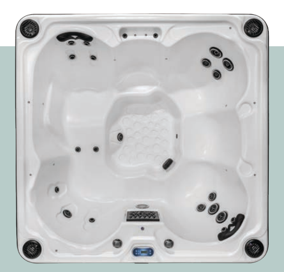
ROYALE P+ 21 Jets | 1 Jet Pump

Shown in White Satin Shell and optional speakers