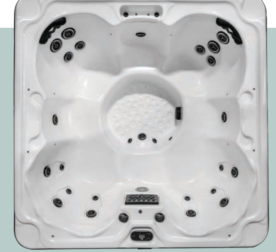
REGAL 31 Jets | 1 Jet Pump Shown in White Satin Shell