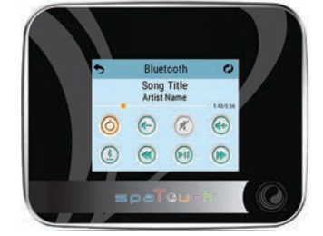
BBA STEREO FOR SPATOUCH