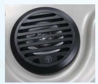
BLUETOOTH STEREO WITH SPEAKERS