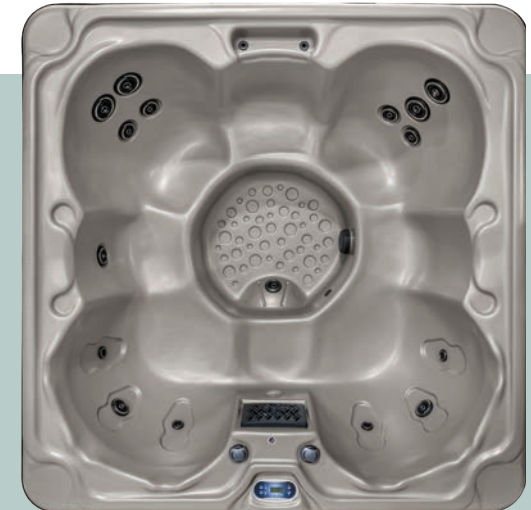
REGAL P 17 Jets | 1 Jet Pump Shown in Opal Satin Shell

The collection of Regal models within the Viking series offers barrier-free seating at it's best. Featuring two of the unique three direction corner seats, get the ultimate hydromassage you're looking for. With LED lighting and a cascading water feature to set the mood, find the configuration that works best for you.