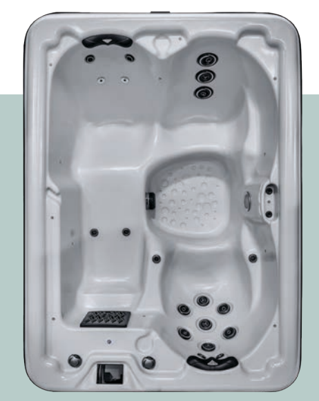
AURORA P+ 21 Jets | 1 Jet Pump Shown in White Satin Shell