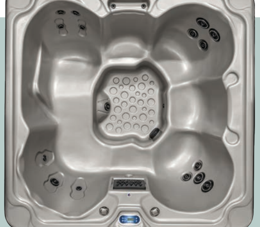
ROYALE P 17 Jets | 1 Jet Pump Shown in Opal Satin Shell

Shown in White Satin Shell and optional speakers