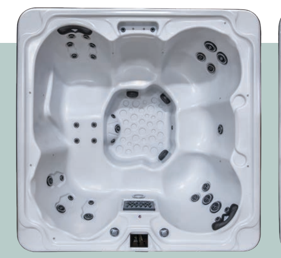
ROYALE ETS 31 Jets | 2 Jet Pumps Shown in Silver Satin Shell

Within the Royale collection of hot tubs in the Viking Series, you will find the perfect configuration to suit your needs. LED lighting and a cascading water feature set the mood. With a comfortable lounger and two spacious captain's chairs you can take advantage of all the hydrotherapy this spa has to offer.